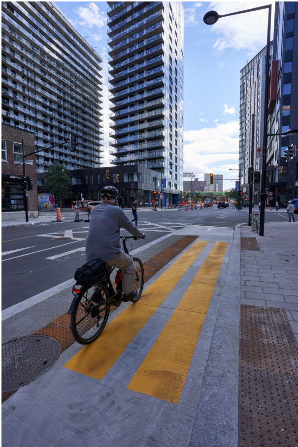
Intersection of Rue Peel and Rue Wellington